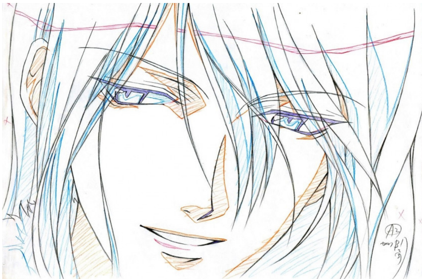
A genga of Agamatsu Soubi from Loveless (episode 1). Loveless was digitally animated, but all of the sketch work was done on paper.