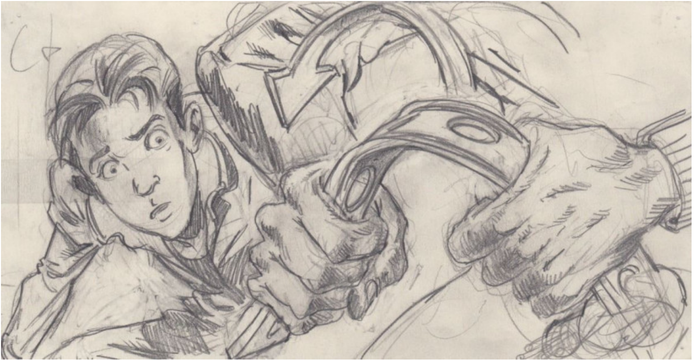
A storyboard from the film Titan A.E. (Original)