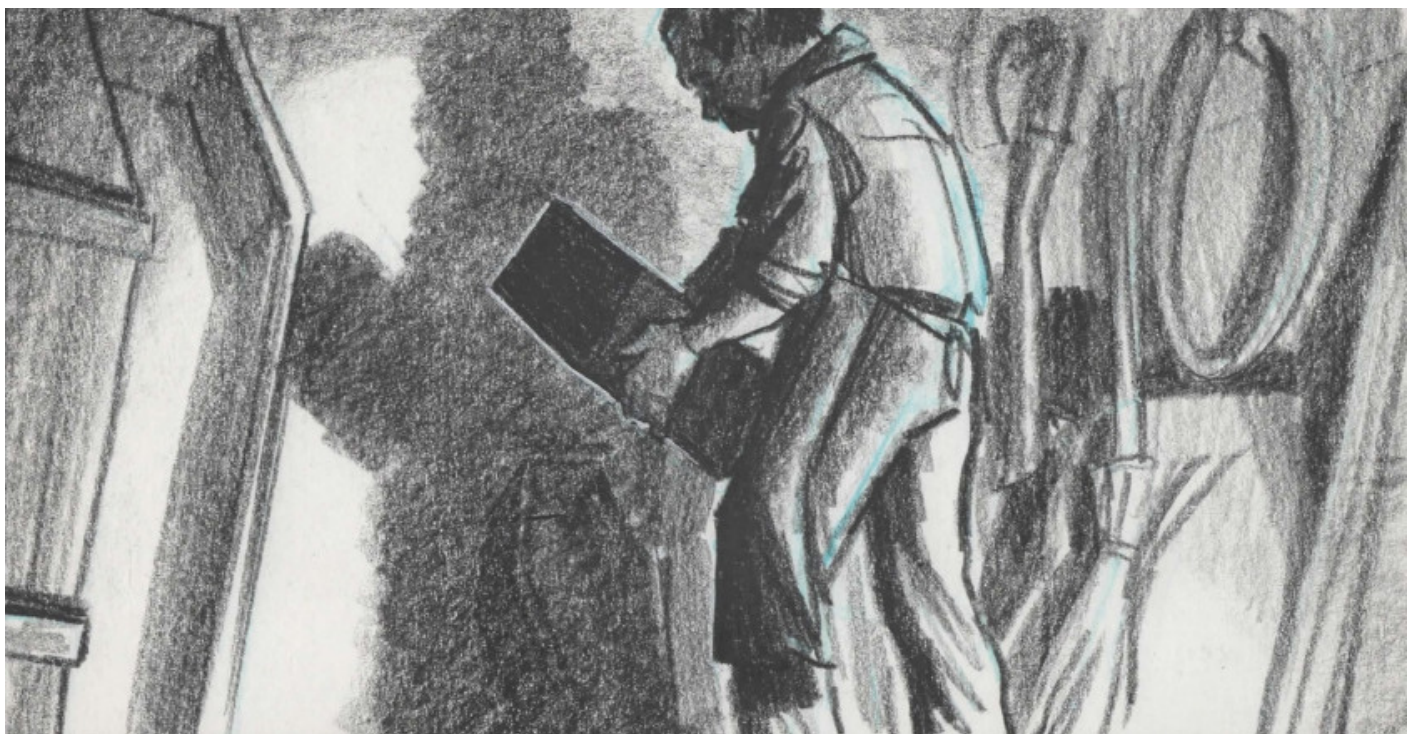
A storyboard from the film Balto. (Original)