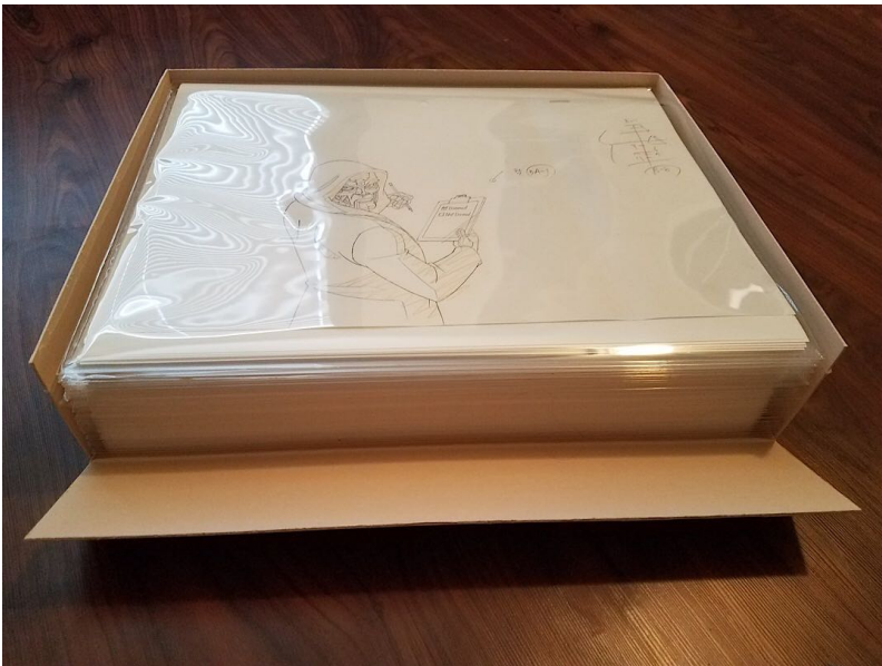
Example of Lodima archival art boxes made with Microchamber technology. 2nd Photo: Sketches stored with archival backing boards and Mylar Bags.